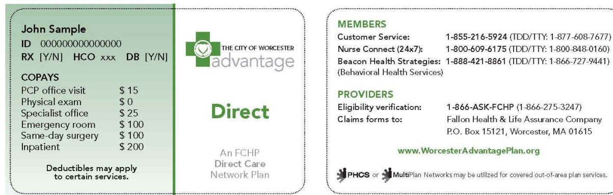
City of Worcester DIRECT