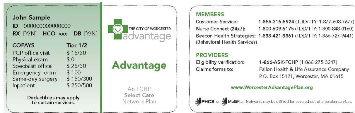
City of Worcester ADVANTAGE