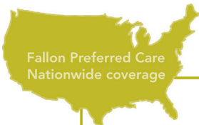
Fallon Preferred Care Nationwide coverage

An extensive national and regional network comprised of over 650,000 providers gives your clients and their employees the flexibility to receive care from any provider they wish—whether the provider is in the network or not! And with Fallon Preferred Care, premiums are only 20% more than with FCHP Select Care.